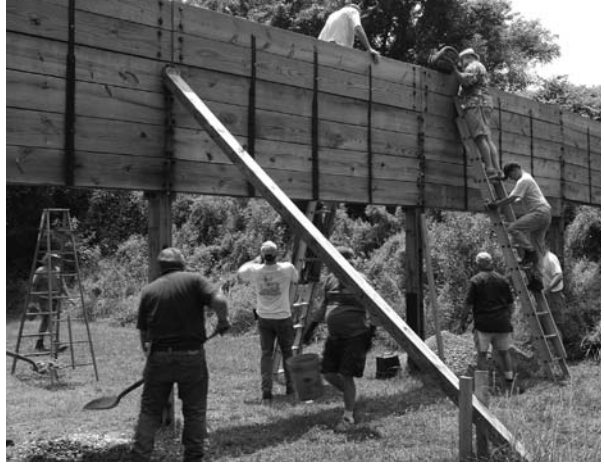
AAF&G Score • August 2008 • 8