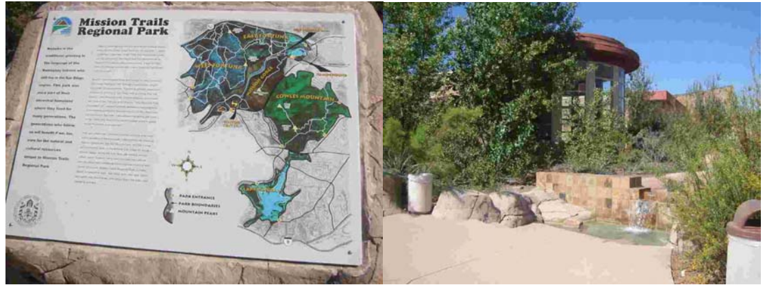
Incorporates Lake Murray as well as numerous hiking trails & a state of the art Visitor Center