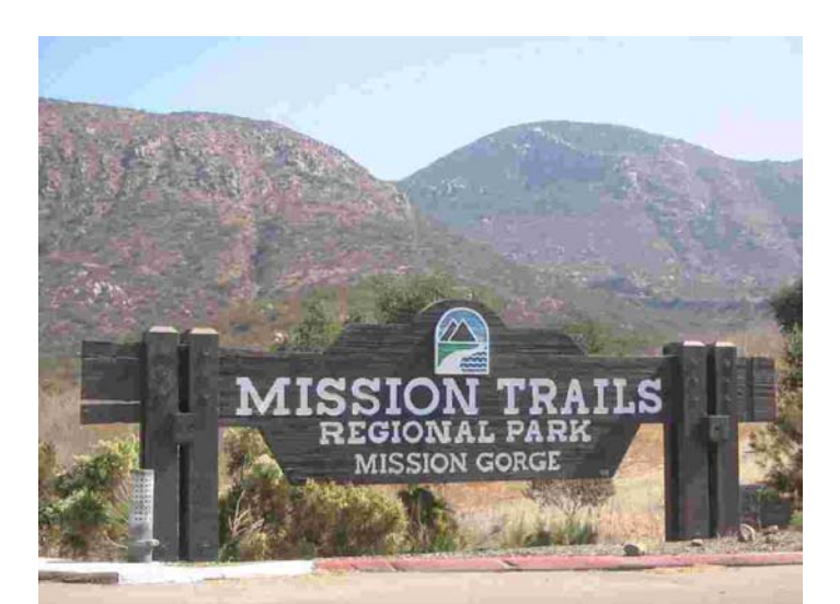
Welcome to Mission Trails...Only 5 miles away