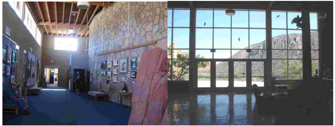
Here is a glimpse at Visitor Center with its panoramic view of "The Mission Gorge"