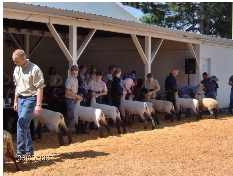
Market Lamb Classes - 2007