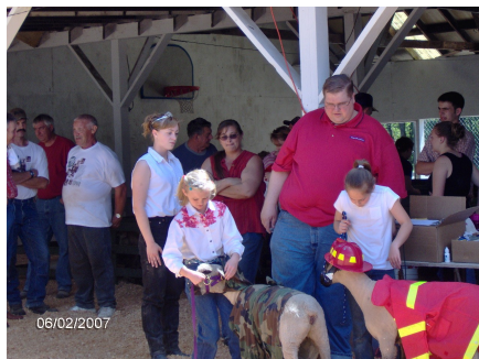
Most Beautiful Lamb Contest