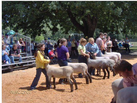
Showmanship Classes - 2007