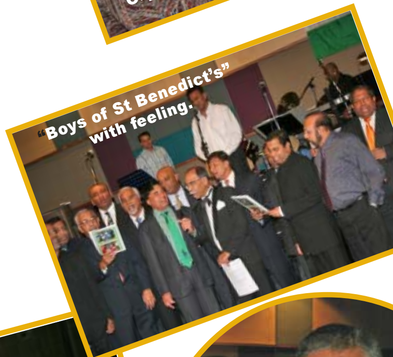
"Boys of St Benedict's" with feeling.