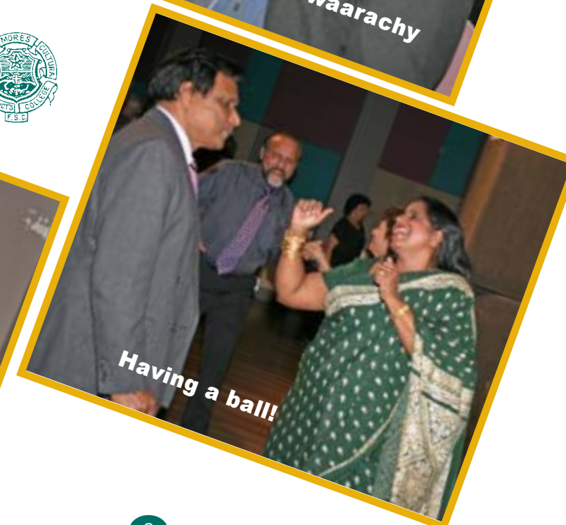
Having a ball!