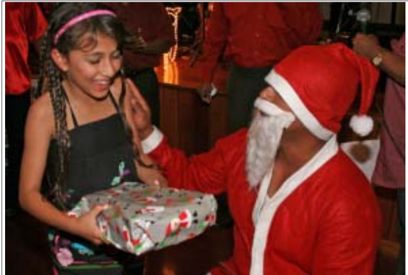
• She's got every reason in the world to smile about!