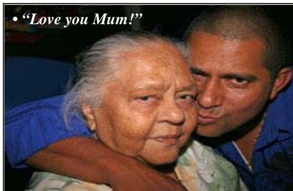
• "Love you Mum!"