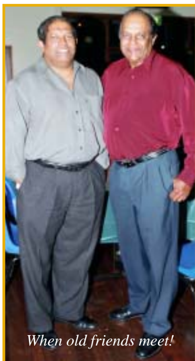
When old friends meet!