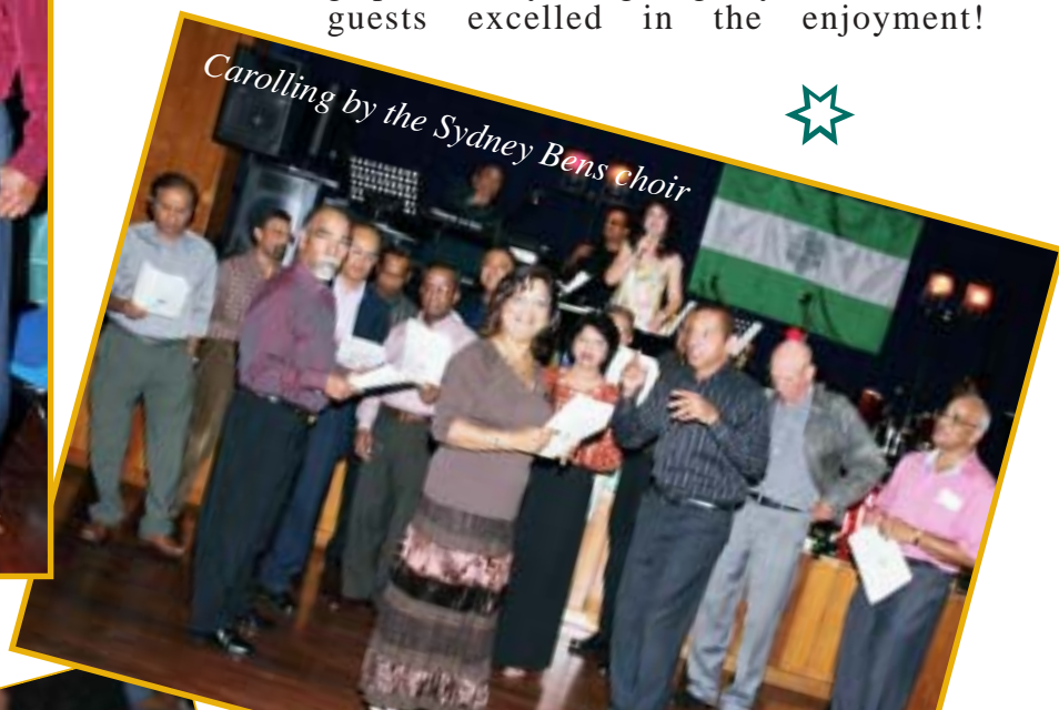
Carolling by the Sydney Bens choir