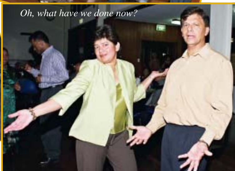
Oh, what have we done now?