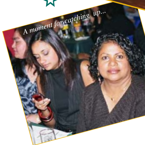
A moment for catching up...