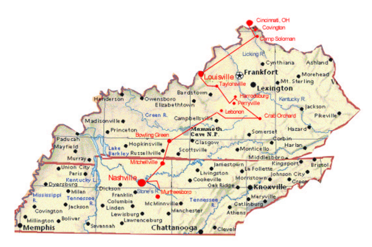
Figure 1 - Route of John B. Corey