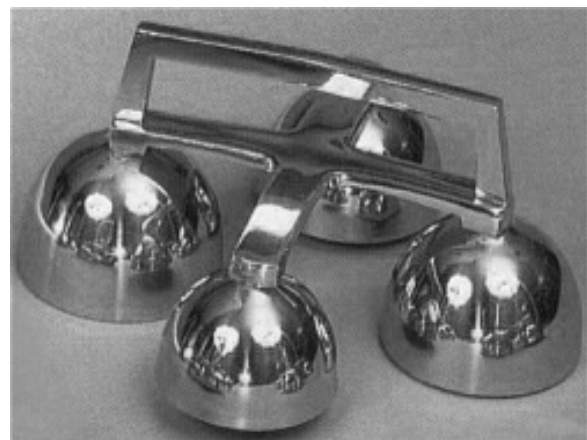
Modern Sanctus bells often have a simple, utilitarian look but can still produce beautiful sounds due to their high quality bronze construction.

The use of Sanctus bells is enjoying a renaissance in the Catholic Church today. As Catholic liturgical history becomes better disseminated and understood, more and more individuals are beginning to view the Sanctus bells as part of the rich sacramental tradition of the Church much like: bread, wine, oils, statuary, vestments, candles, incense, and historic and/or solemn places of worship.