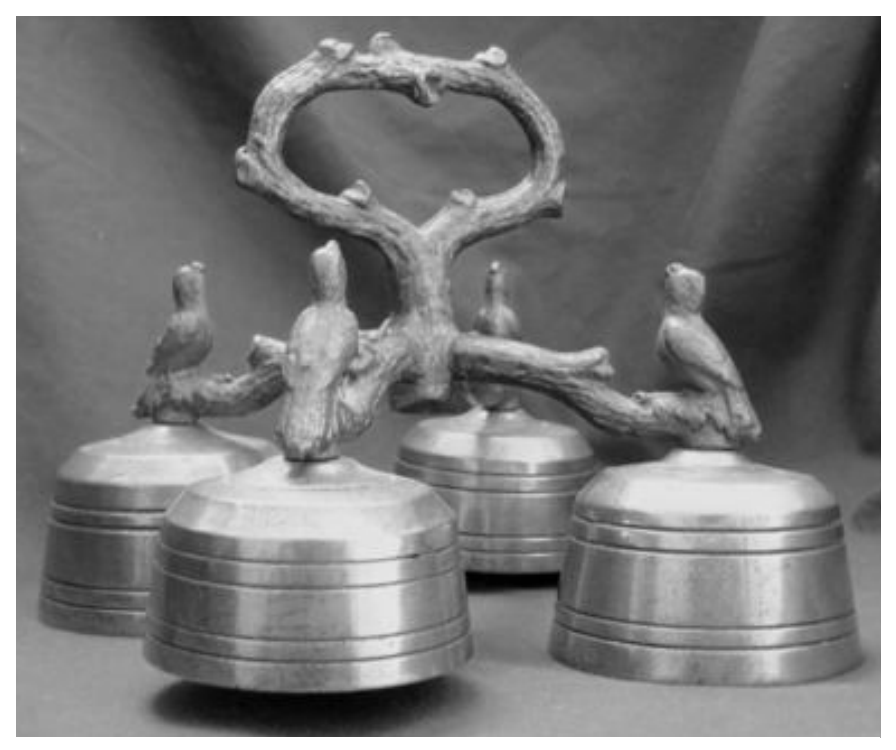
Some handheld Sanctus bells can be quite ornate. This beautiful bronze set dating from the early 1900s sports a singing bird above each bell. Such sets are highly prized by collectors today.

"On its skirts you shall make pomegranates of blue and purple and scarlet stuff, around its skirts, with bells of gold between them, a golden bell and a pomegranate, round about on the skirts of the robe. And it shall be upon Aaron when he ministers, and its sound shall be heard when he goes into the holy place before the Lord, and when he comes out, lest he die."