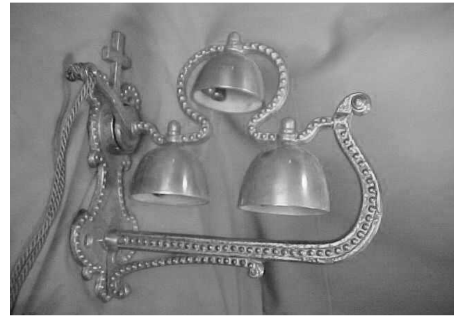
Ornate bronze sanctuary chimes were once commonly mounted near the altar or credence table.

6. Missale Romanum (Roman Missal.) New York: Benziger Brothers, 1962.