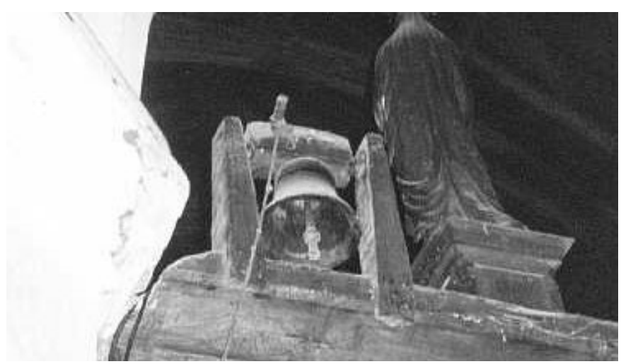
Many Catholic (and later Anglican) parishes particularly in the British Isles once placed small Sanctus bells atop the rood screens which separated the chancel from the nave of the church. This was a refinement of using larger outdoor tower bells.