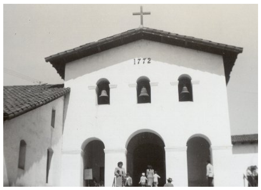
The earliest Sanctus bells were typically the largest or smallest outdoor bell of a cathedral or parish church similar to those of Old Mission San Luis Obispo de Tolosa shown above.

This practice of ringing bells to create a joyful noise for the Lord during the Mass is based to some degree on the use of tintinnabula (Latin for tiny bells) or crotal bells that were a part of ancient Judaic worship.