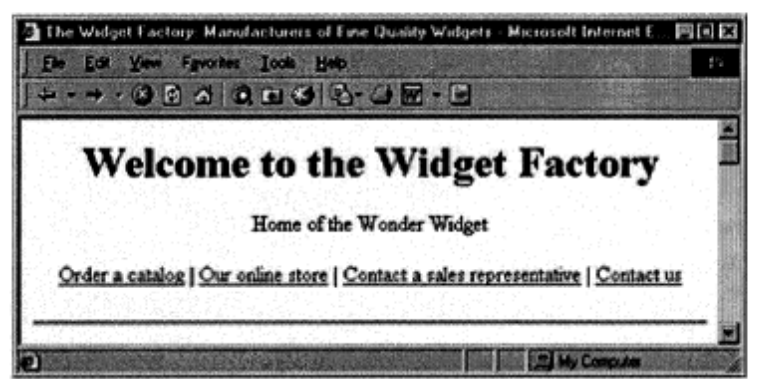
Figure 4-6: Use intradocument links to create a document navigation system.

When you click on the hyperlinks at the top of the page, the Web browser should scroll to the spot to which the link points. If there is less than a browser window's worth of content to display after the spot, the browser simply brings the spot into view on the page, instead of bringing the spot to the top of the page.