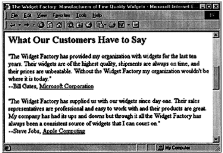
Figure 4-3: Anchor tags link text to other Web sites.

If you click on these hyperlinks, they should take you to the Microsoft and Apple Web sites, respectively.