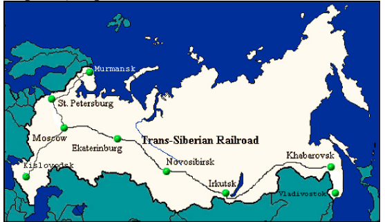
Figure 3 Map of the TROICA expeditions

This laboratory is used to continue the TROICA (Transcontinental Observations Into the Chemistry of the Atmosphere) experiments.