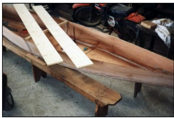
Yellow Leaf in progress in the tractor hangar on the family farm in St.Priest, France.

If I were to do it all over again, I would go with one of the more substantial construction method, since very little time is saved over the disposable one. Personally, I would take the few pounds of weight penalty to go with wood chine logs, and maybe wood stem and stern posts, to avoid working with fiberglass altogether. It's not the resin that bothers me, it's all the sticky strands of glass.