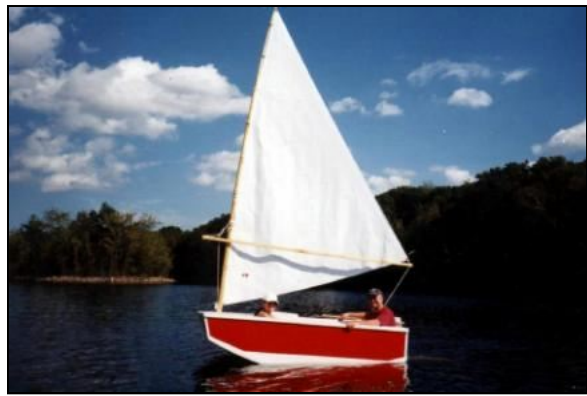
Drifting in light air with room for at least two more crew.

Yes, you can! Unfortunately, I didn't keep any kind of log or take many photos during the building of my Brick. I began back in the fall of 1997 in a woodworking class--Rebecca, the instructor, kindly tolerated the boatbuilding eccentric--but I didn't get much done there.