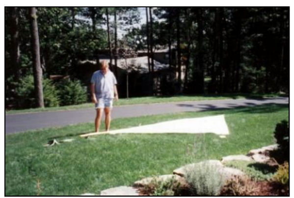
Working out the details of the rig on my parents' front lawn. Both of Payson's books are close at hand on the grass.

Setting up, cleaning up. and waiting for tools took up much of my time. The large bench tools were more trouble than they were worth for large sheets of plywood. I later learned to move the tools, both power and manual, with the parts stationary on a sawhorse.