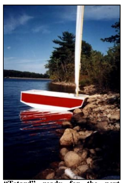
"Tetard" ready for the next adventure.