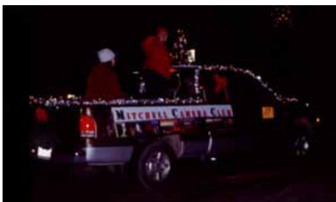
Finally on there way down the parade route!