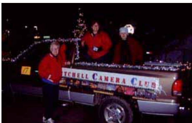
The girls try to stay warm while they wait for the parade to begin.