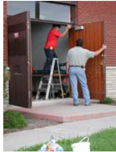
Queensway Door Service installing an elegant new glass door.

A new entrance to the CE Hall was installed June 21, 2005 by Queensway Door Service. The new entrance includes two glass-aluminum doors, a