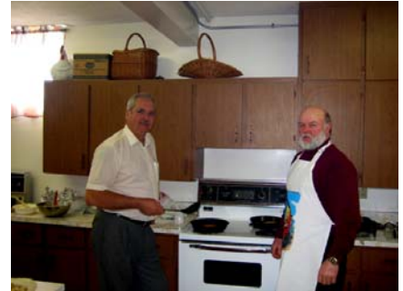
Pancake day, April 3, found the men of Fallowfield hard at work in the church kitchen, making pancakes. This annual event is very popular with the women of the congregation.