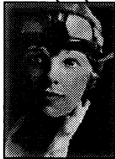
Earhart, missing since 1937