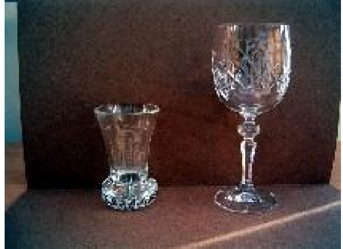
Firing and Wine Glasses presented to Lodge members and our guests at the White Table Meeting