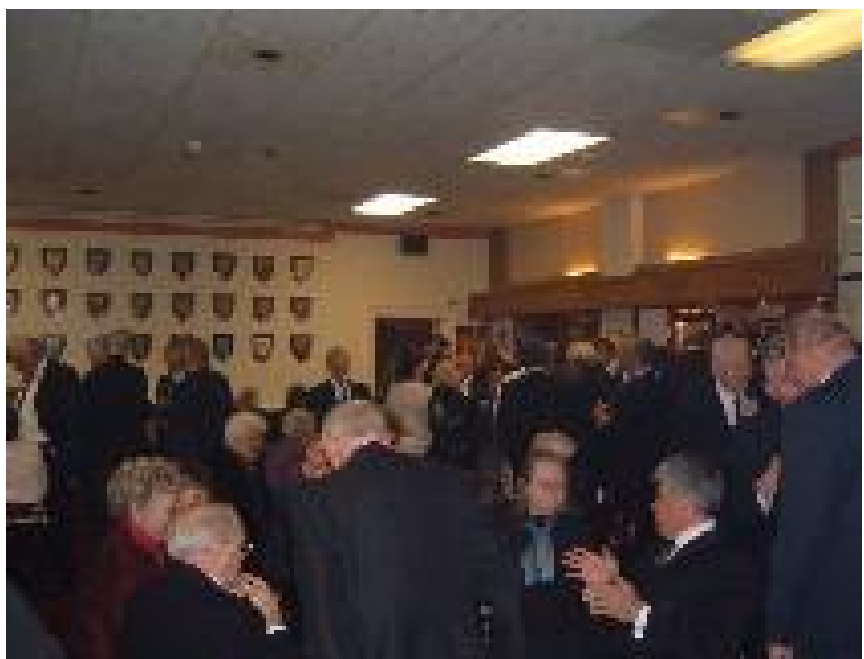
Members and Guests at the Bar

The Crayford Lodge White Table Meeting to commemorate our 60<sup>th</sup> Anniversary was held on Wednesday 22<sup>nd</sup> November 2006 at the Dartford Masonic Centre.