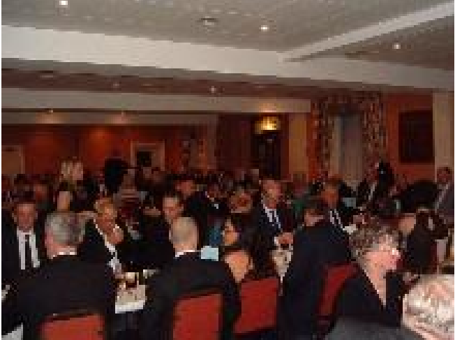
Members and Guests at the Festive Board

Crayford Lodge No 6336 60<sup>th</sup> Anniversary Meeting