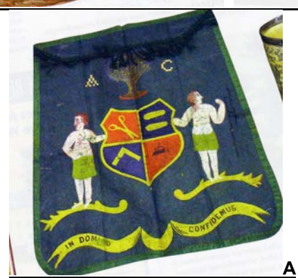
At the UGLofE Museum