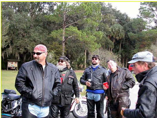
Some of the tough riders