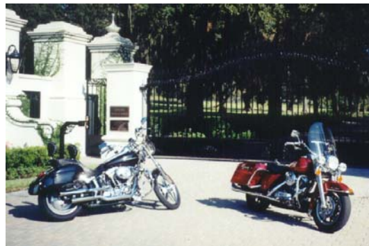
One of the many gates into Robert’s Quarter Horses