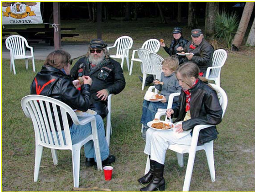
Everyone enjoys the fried chicken