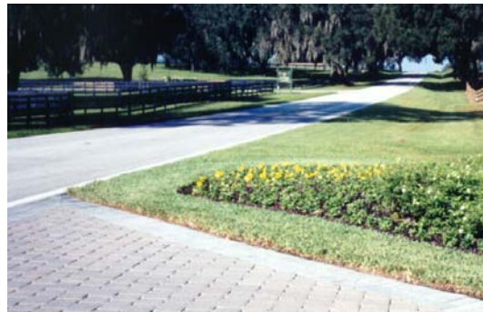
One of the many scenic roads in horse country