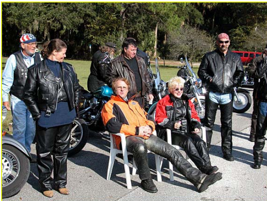
Catching a few rays to warm up at Marjorie Rawlings Park