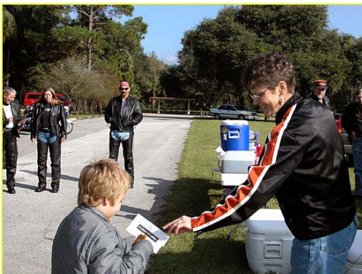
Handing out one of the many door prizes

The money earned for the ride went to Altrusa House. Altrusa House is an adult health care facility for frail adults