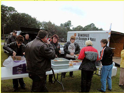
Food for the cold and hungry