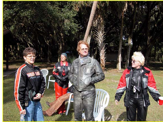
Enjoying the warm rays