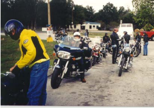
Stopping along the way for a break