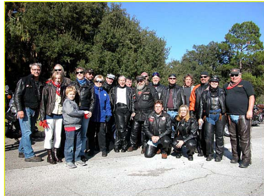
Our ABATE friends who gave big support to the HOG benefit ride