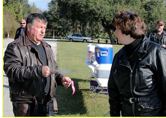
50/50 winner donates winnings to Altrusa House