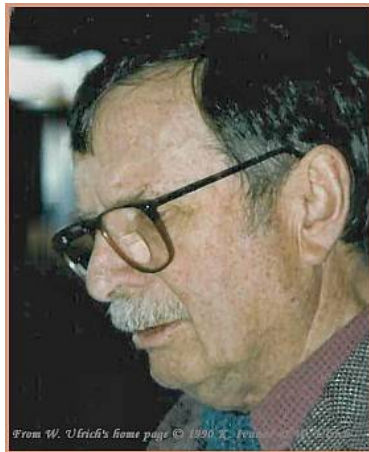
C. West Churchman, Dec. 1990

The year 1971 was to see the publication of yet another important book, The Design of Inquiring Systems . It is one of the more difficult books by Churchman, but perhaps it is also his most original one. In my understanding, the book represents another attempt of Churchman's to approach his fundamental question of how it is possible to secure improvement by means of the intellect. Improvement implies learning; can systems design secure learning? Churchman's idea was to look at different epistemologies that the history of philosophy has brought forth, as designs for inquiring systems, i.e., systems that would be capable of learning. What can we learn from Leibniz, Locke, Kant, Hegel, and Edgar A. Singer about the possibilities and limitations of designing systems that could secure improvement?