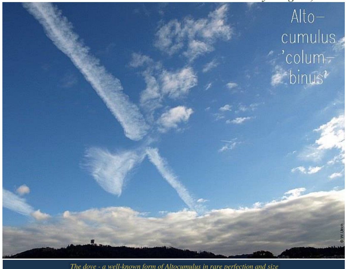
The dove - a well-known form of Altocumulus in rare perfection and size