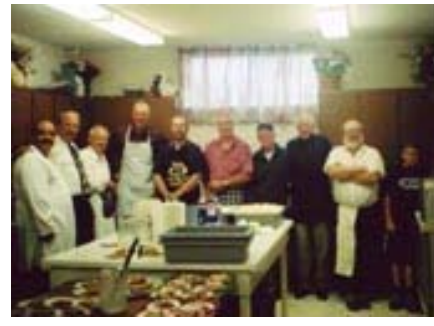
On April 30, the men of Fallowfield held another successful beef dinner

Pancake day, April 3, found the men of Fallowfield hard at work in the church kitchen, making pancakes. This annual event is very popular with the women of the congregation.