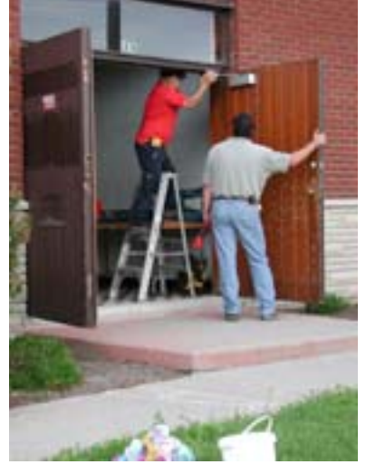
Queensway Door Service installing an elegant new glass door.

thermopane transom, and four thermopane side-panes. The cost will be about $7200, of which $2000 was contributed by the Fellowship Group. The